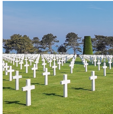
75th anniversary of D-Day: Reflecting on sacrifice and...