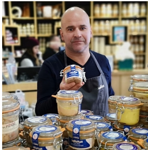
Maison Samaran's chief on 50 years of foie...