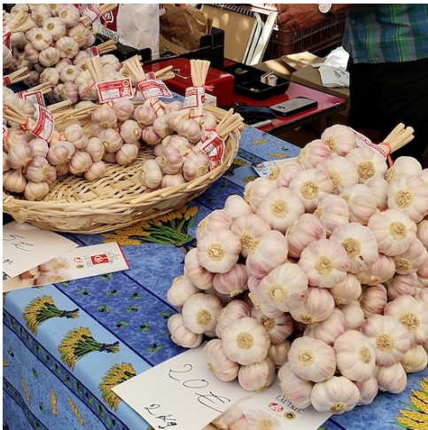
Lautrec's Pink Garlic Festival celebrates Tarn's famous crop